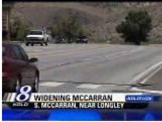
R-T-C ON KOLO (ABC) - RENO, NV 06/21/2011 06:05:06 AM KOLO 8 DAYBREAK 6AM EDITION (NEWS, LOCAL)