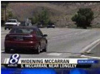
R-T-C ON KOLO (ABC) - RENO, NV 06/20/2011 11:08:32 PM KOLO 8 @ 11PM (NEWS, LOCAL)