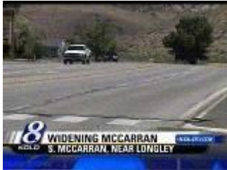
R-T-C ON KOLO (ABC) - RENO, NV 06/21/2011 07:56:48 AM GOOD MORNING AMERICA (NEWS, NEWSMAGAZINE)