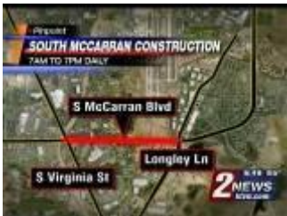
R-T-C ON KTVN (CBS) - RENO, NV 06/20/2011 06:46:42 PM CHANNEL 2 NEWS 6:30PM (NEWS, LOCAL)