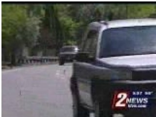
R-T-C ON KTVN (CBS) - RENO, NV 06/20/2011 05:07:25 PM CHANNEL 2 NEWS 5PM (NEWS, LOCAL)