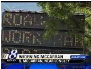
R-T-C ON KOLO (ABC) - RENO, NV 06/20/2011 06:36:17 PM KOLO 8 @ 6:30PM (NEWS, LOCAL)