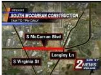
R-T-C ON KTVN (CBS) - RENO, NV 06/20/2011 05:06:24 PM CHANNEL 2 NEWS 5PM (NEWS, LOCAL)

Among the news stories in the past two weeks, the RTC was featured for the kickoff of $16 million in improvements to S. McCarran. The news stories equated to a minimum $10,000 in earned media coverage.